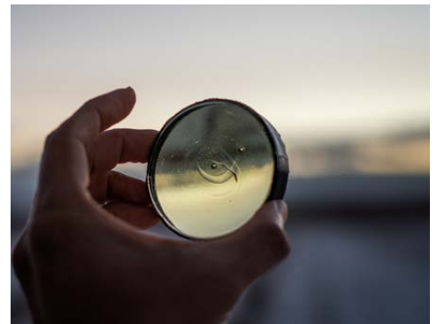
Solaris , 2017. Oscar Santillán

So, what is the IVM?. It is an attempt to allow us, humans, to engage with the vast otherness inhabiting Earth by amplifying care rather than coercion. Therefore, the IVM is an interface for decentralized cognitions to relate to each other and/or to express themselves.